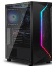
Computer System Unit