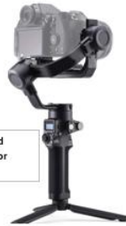
Handheld Gimbal for DSLR