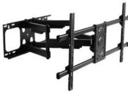
TV Wall Mount for Large TV