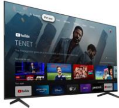
85-inch 4K Ultra HD TV & 75-inch 4K Ultra HD TV