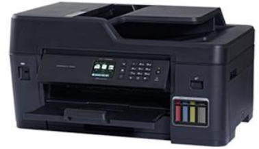
A3 Refill Ink Tank Multi-Function Printer